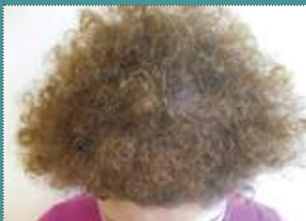
12 Months Later