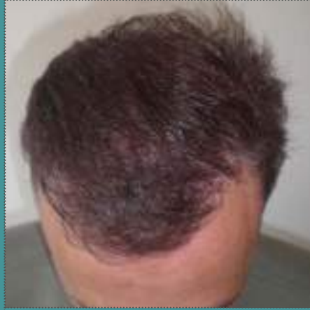
10 Months Later