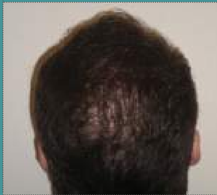
14 Months Later