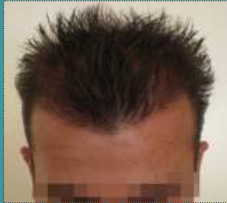
8 Months Later