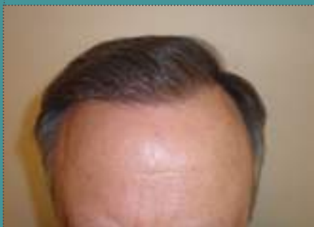
12 Months Later