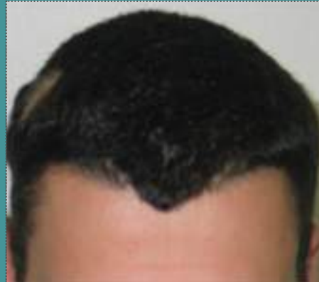
6 Months Later