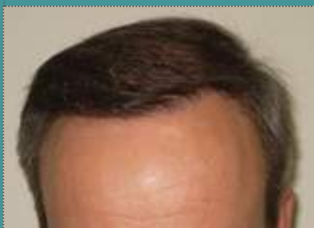
8 Months Later