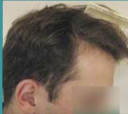
3 Months Later