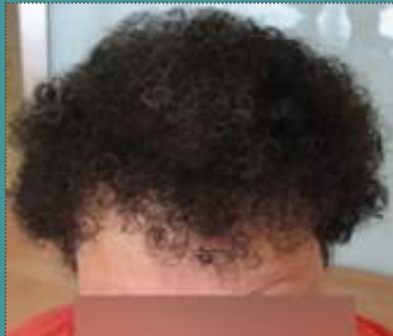
12 Months Later