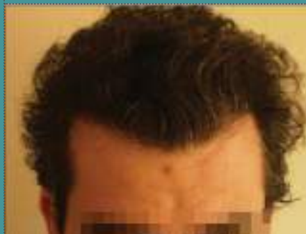
12 Months Later